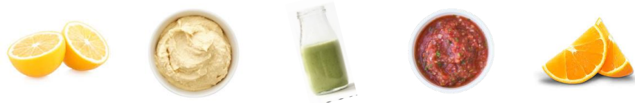
A squeeze of lemon, lime or orange juice, guacamole, balsamic vinegar, white wine vinegar, salsa, hummus, oil-free dressing

Add flavor with a squeeze of citrus, a dollop of dip, or a drizzle of dressing