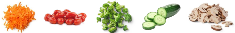
Artichoke hearts, asparagus, bell peppers, broccoli, carrots, cauliflower, cucumber, microgreens, mushrooms, onion, snap peas, summer squash, tomatoes, etc.

Add texture and color with a variety of vegetables, raw, steamed or roasted, unlimited