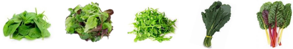
Baby spinach, chopped kale, Swiss chard, arugula, shredded cabbage, lettuce, spring mix, shaved Brussels sprouts, etc.

Start with a hefty base of leafy greens, 2 to 3 cups