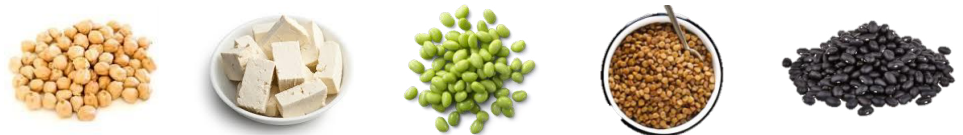
Chickpeas, black beans, kidney beans, white beans, green peas, lentils, edamame, organic tofu, organic tempeh

Add hearty plant protein with beans and legumes, 1/2 cup