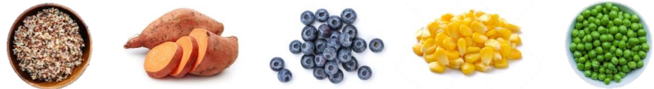
Quinoa, brown or wild rice, farro, barley, potatoes, yams, winter squash, corn, peas, mango, apples, berries, citrus segments, pomegranate seeds

Add filling fiber with whole grains, starchy vegetables, and/or fruit, 1/2 cup