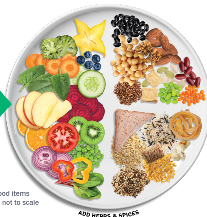
*Food items are not to scale