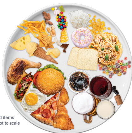
*Food items are not to scale

Decrease sweets and snacks, fast food, fried foods, refined grains, refined sugar, meat, dairy, eggs, poultry, high sodium foods